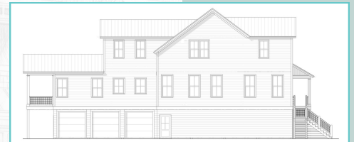
Left Side Elevation