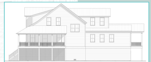
Right Side Elevation