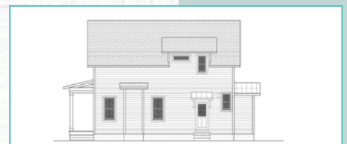
Right Side Elevation